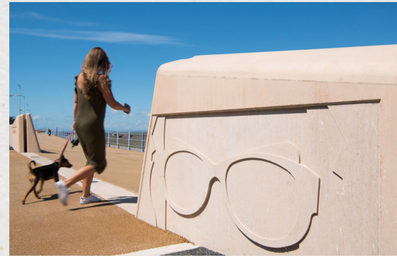
Eric Morecambe wall pattern

Atkins developed a design to replace the sea wall and the resultant scheme has set a new standard in design by enhancing the local landscape working with the cultural and historic environment, promoting active use and appreciation of the spectacular views across Morecambe bay towards the distant Lake district as well as protecting 13,000 properties.