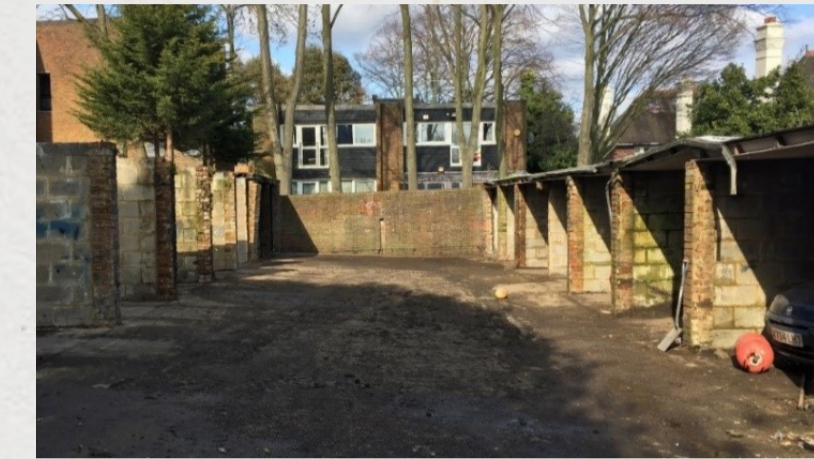
At EDAROTH we develop under-utilised land, often on difficult to access sites

Atkins has recently launched a new development arm called EDAROTH – as we believe that Everyone Deserves A Roof Over Their Head' and we have taken this powerful acronym as the company name and purpose.