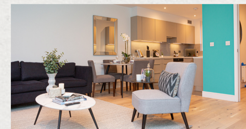
EDAROTH offer multiple home typologies; houses and apartment blocks designed to the need of our client

The product range includes both houses and apartments, with a variety of occupancy and accessibility configurations to suit our clients' specific housing needs and providing the flexibility to respond to local planning requirements. Our homes have been designed around occupant needs, providing generous living space, lower energy costs and strong environmental performance. All our homes exceed nationally described space standards and, compared to traditional UK housing, achieve reduced energy consumption and life cycle carbon.