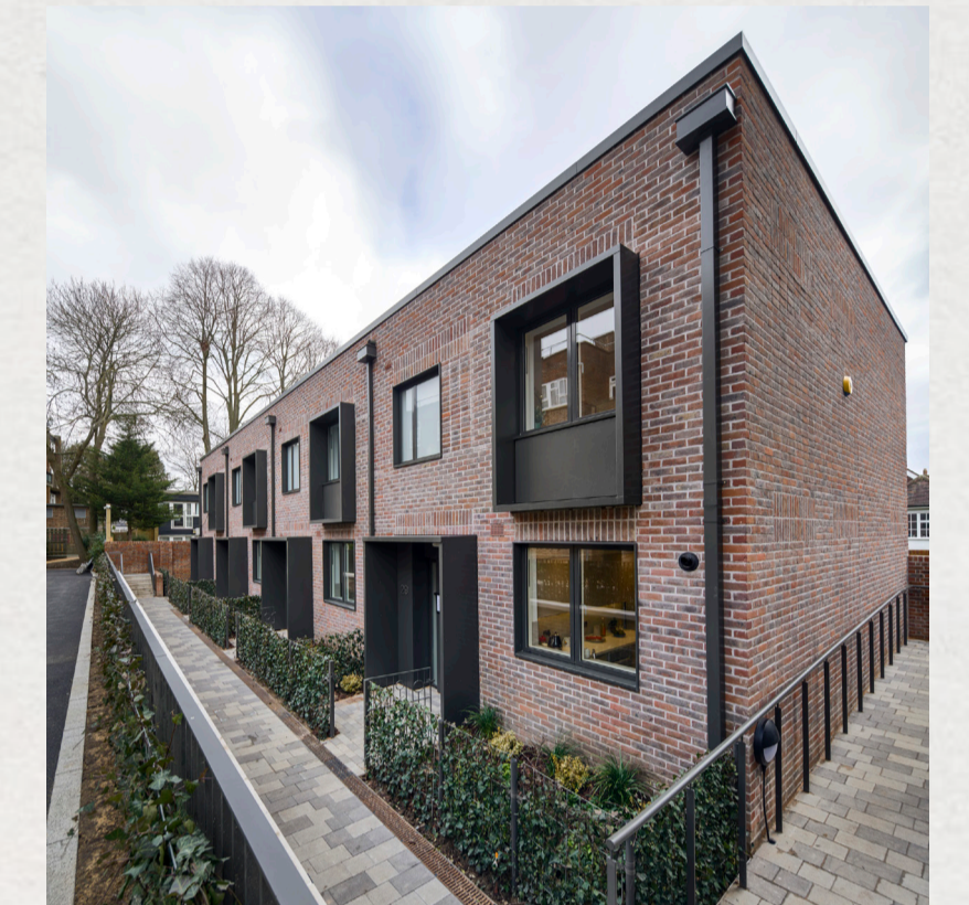
Our completed pilot scheme at Lambeth. EDAROTH hand the homes and the land back to the Local Authority.

EDAROTH, a subsidiary company of Atkins, is bringing a new solution to the housing crisis by reimagining the way social and affordable homes are delivered. Providing homes in which people want to live, EDAROTH will encourage social cohesion and access to opportunity by promoting sustainable and inclusive communities.